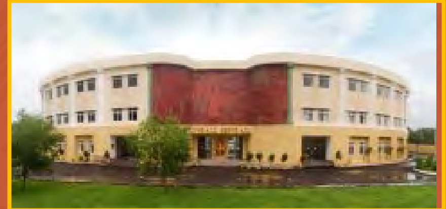
Palwal, Haryana Nov 2016