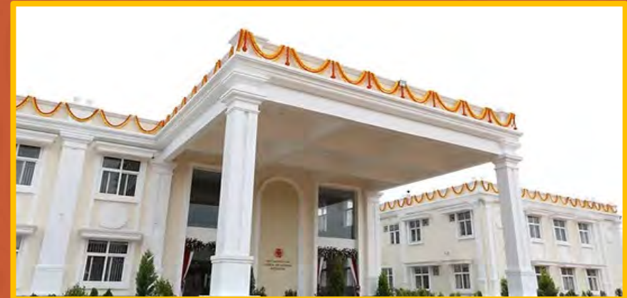
Sarla Memorial Hospital July 2021