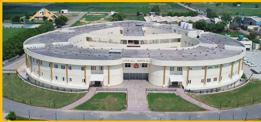
Mumbai, Maharashtra Nov 2018