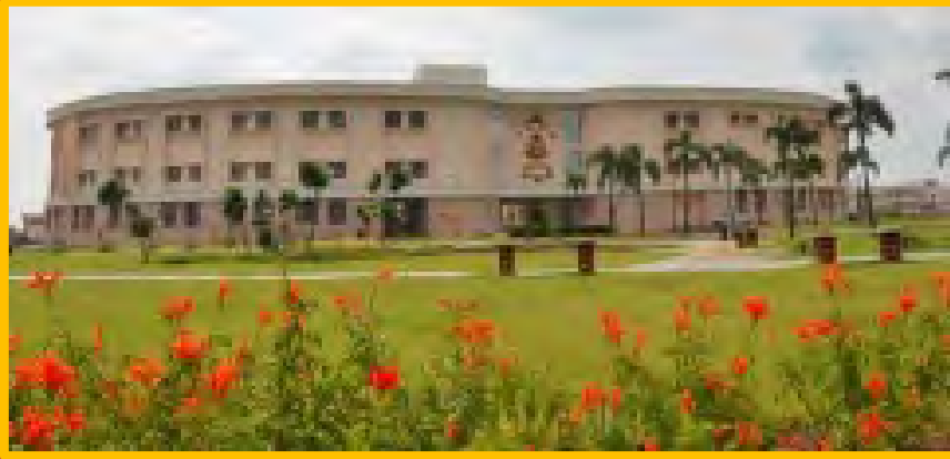
Nava Raipur, Chhattisgarh Nov 2012